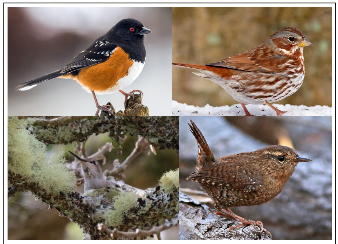
Clockwise from top left: Spotted Towhee, Fox sparrow, Pacific Wren, and a near-ground nesting Anna's hummingbird, in an oak.

Keeping human and canine feet on marked trails is especially important for the ground nesting birds in the park. These ground nesters are busy right now, preparing nests and incubating their eggs and young. They don't want to leave their eggs but will do so if we or our dogs venture too close. Every bit of stress they feel reduces their chances for success. This makes the park poorer in the long run. Remember, Mount Douglas Park serves to preserve the natural area as well as provide a setting for our rest and recreation.