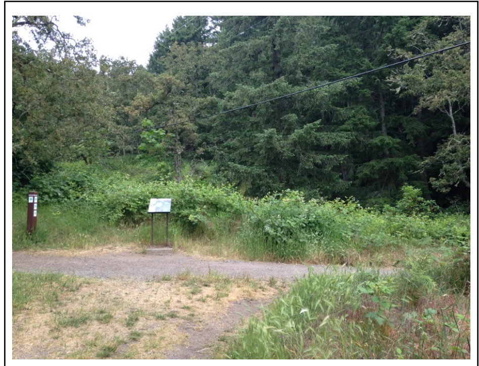
Restoration Site - Whittaker Trail at Cedar Hill Road - June 2019

In Fall and Winter 2019, at a site along the southeast corner of Whittaker Trail (at Cedar Hill Road) volunteers cut down and dug out a dense area of Himalayan Blackberries. To protect this cleared site Parks staff constructed attractive split rail fencing in December, 2019. The fencing is there to protect young native plants that were planted by volunteers early 2020. The immature plants do not survive trampling. They need time to grow strong and thrive. In the spring of 2021, volunteers will return to re-weed the site and add more native plants to increase site biodiversity.