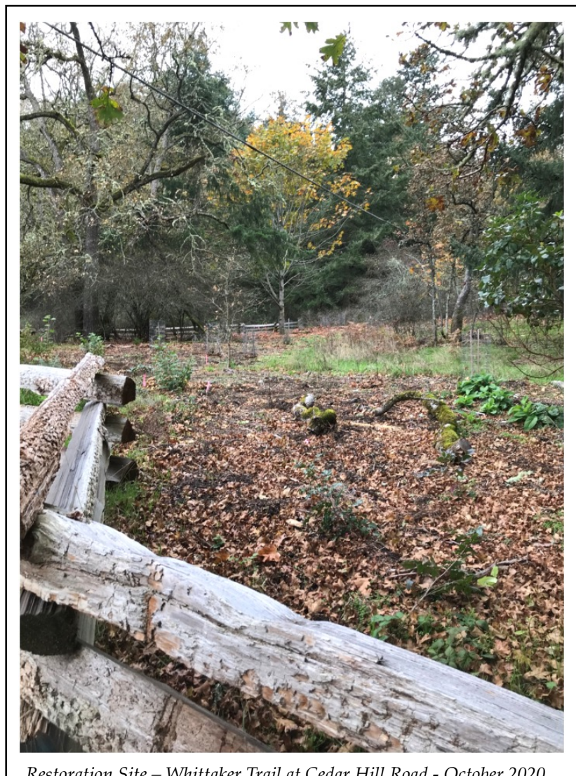
Restoration Site – Whittaker Trail at Cedar Hill Road - October 2020