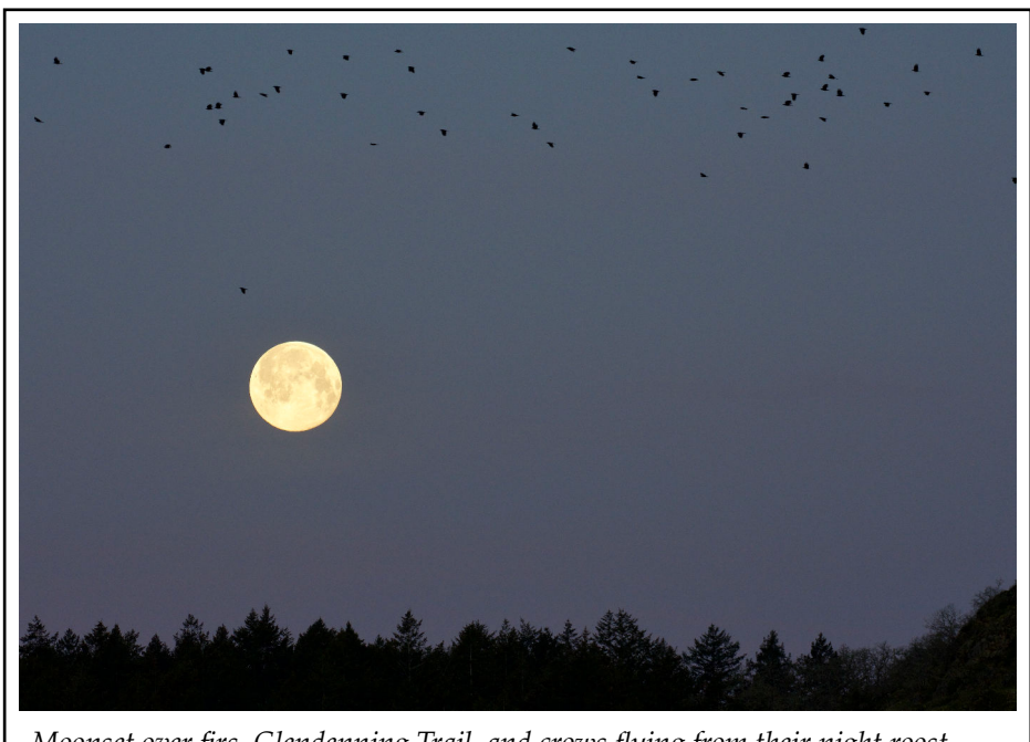
Moonset over firs, Glendenning Trail, and crows flying from their night roost.