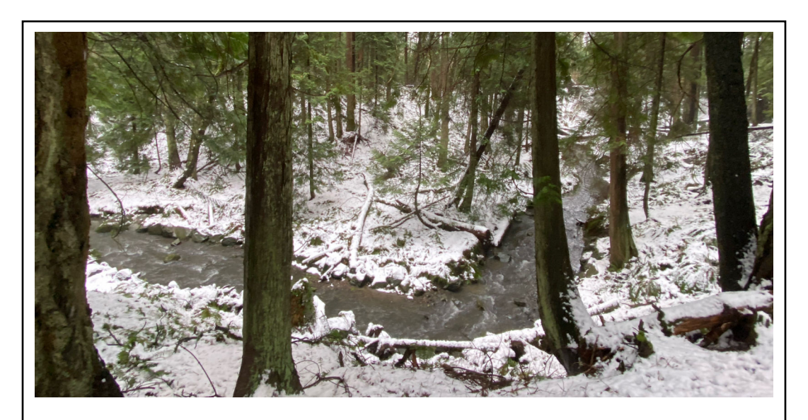
Remember the snow in February? Here's a view of a bend in the creek from February 15, 2021.