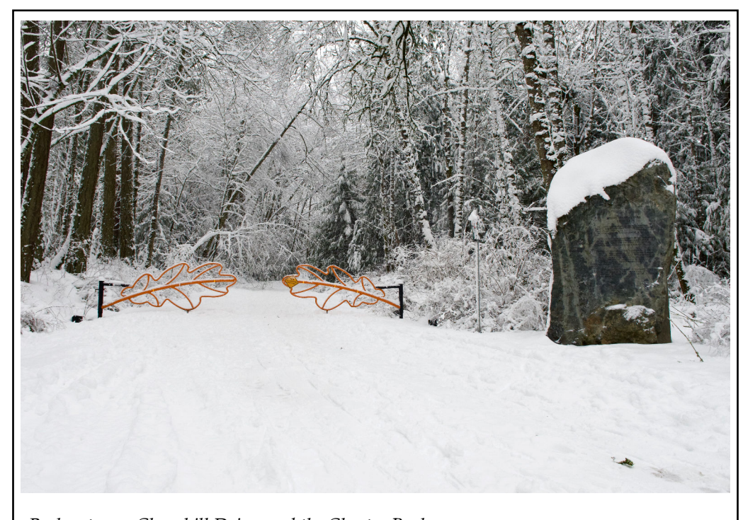
Park gates on Churchill Drive, and the Charter Rock.

With the addition of the Charter Rock, the information kiosk, and the new gates, Churchill Drive has been transformed and many visitors are introduced to the charms and delights of Mount Douglas Park by using this entrance.