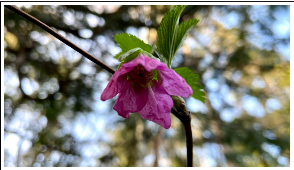
A salmonberry flower opening, on March 26, 2021.