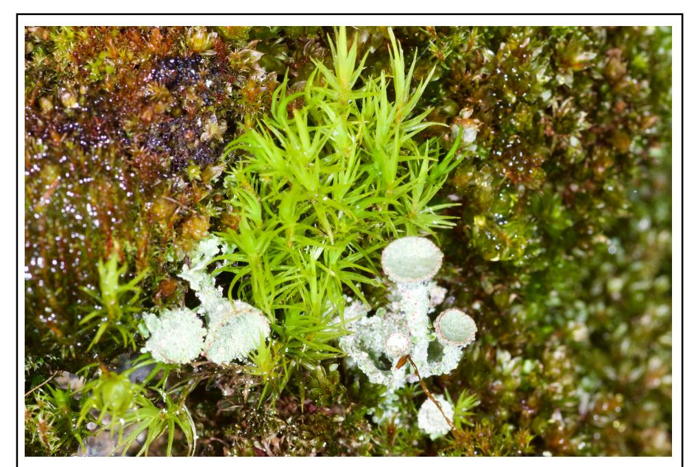
Tiny cup lichen and moss in the rain, Irvine Trail.