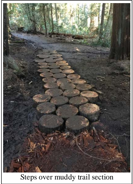
Steps over muddy trail section

Etiquette Pictographs: Many Park visitors are unaware of the Saanich Parks bylaws and voluntary etiquette necessary to preserve a natural park. Many have a sense that they are just one person picking mushrooms or fiddle heads or salal for their flower arrangement, or believe a single person walking off trail could never be an issue, not realizing there are ten, twenty or a hundred of the annual 400,000 visitors right behind them with the same idea. With the philosophy that a picture can be worth a thousand words, and that pictures are multi-lingual, the parks planning department is developing a pictograph sign plan.