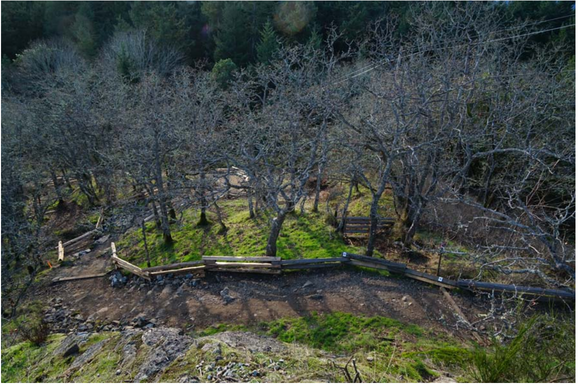
Repaired section of South Ridge Trail

catch basins. Others in the school group will deliver door knob information sheets about the program while the basins are being marked on each street.