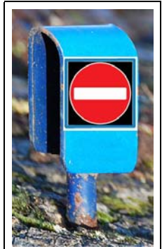
No Entry Not a Trail

Marking Rogue Trails: Whether you call them rogue trails, ad-hoc trails or impromptu trails, these unofficial trails are growing in number as they crisscross many areas. A few need to be converted to official named trails, but most are simply braiding of existing trails and need to be closed and restored. Trail way-finding posts, 90 in total, have been installed at all official trail intersections, but there is nothing marking intersections with rogue trails. Saanich Parks along with our Society are looking at some way to distinguish official from rogue trails. Nobody wants huge signs everywhere, but one thought might be small signs similar to the trail way-finding markers currently used on the Irvine Trail and the South Ridge Trail. It might simply use the universal do not enter sign.