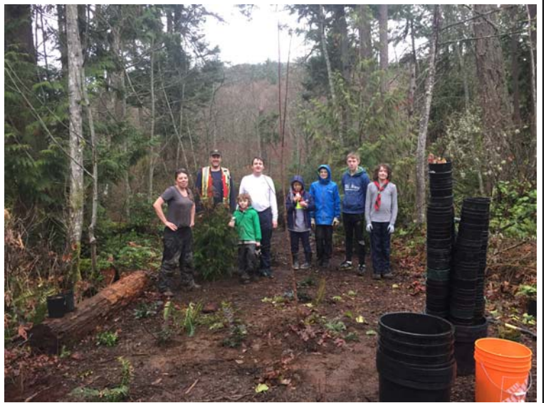
10 th Garry Oak Scouts planted new viewpoint area

One of the heavy machinery routes used to access Douglas Creek during last summer's creek restoration has been converted into a Creek Viewpoint. The route has received restoration planting by the 10 th Garry Oak Scouts based out of St. Dunstan's Church on Tyndall. Saanich Parks has since installed split rail fencing to define the viewpoint.