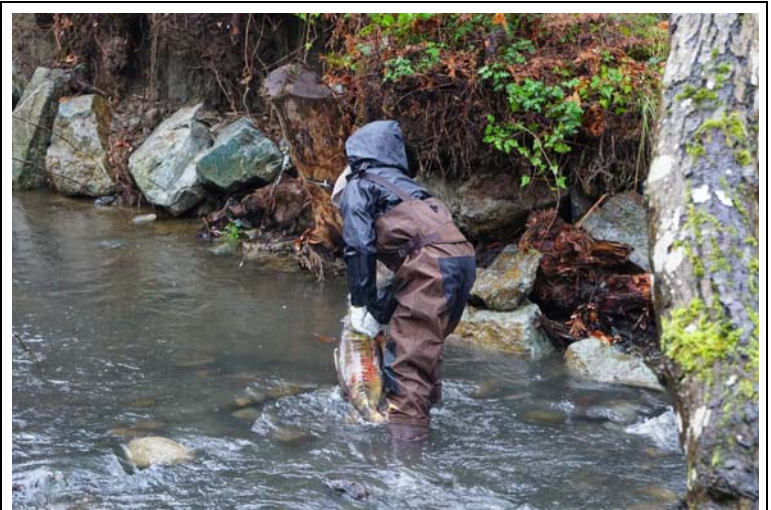
Throwing carcass between rocks

Over 100 frozen salmon carcasses were brought to Douglas Creek in January by the Howard English Hatchery at Goldstream volunteers. Perhaps thirty young and young at heart helped throw the very cold carcasses into the creek. This transplant mimics the results of a large return of salmon to Douglas Creek. The carcasses will decompose into the aquatic ecosystem delivering marine derived nutrients to riparian vegetation and invertebrate populations thus setting up the system for productive trophic webs. Checking a couple weeks after the transplant, and after several rains with accompanying storm surges, carcasses were still scattered in the creek held in place against a rock or tree root balls. There were also carcasses that some animals had dragged up onto the creek banks, all part of the natural process.