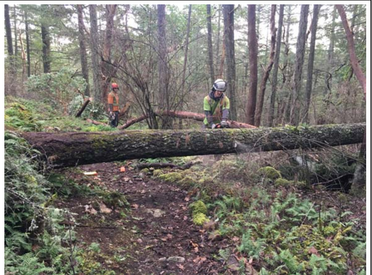
Urban Forest Crews remove another downed tree.

Bridge Across Douglas Creek: Last summer two very large trees, including root system, toppled into the creek about mid-way between Ash Road and the weir, blocking the creek. An excavator was required to move one to the side. The other was too big to move, so the creek channel was moved to bypass the blockage. Access was obtained by reopening a restored access used in 2015, connecting to Cedar Hill Road mid-way between Ash Road and