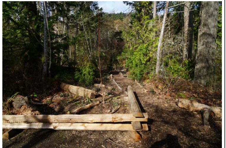
Trail to new creek viewpoint

Upper Glendenning Trail: The upper Glendenning Trail between Harrop Trail and the summit is scheduled for major restoration this year. The lower half of this trail section is composed of loose sand and has suffered from very serious erosion. In the last newsletter, an article detailed the successful repair of a similarly eroded section of the South Ridge Trail. The techniques and